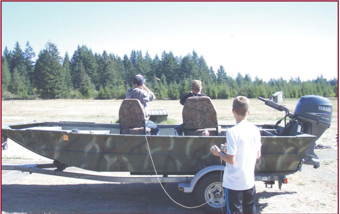
Some of what the Youth learned — Shooting from the seated position in a boat.