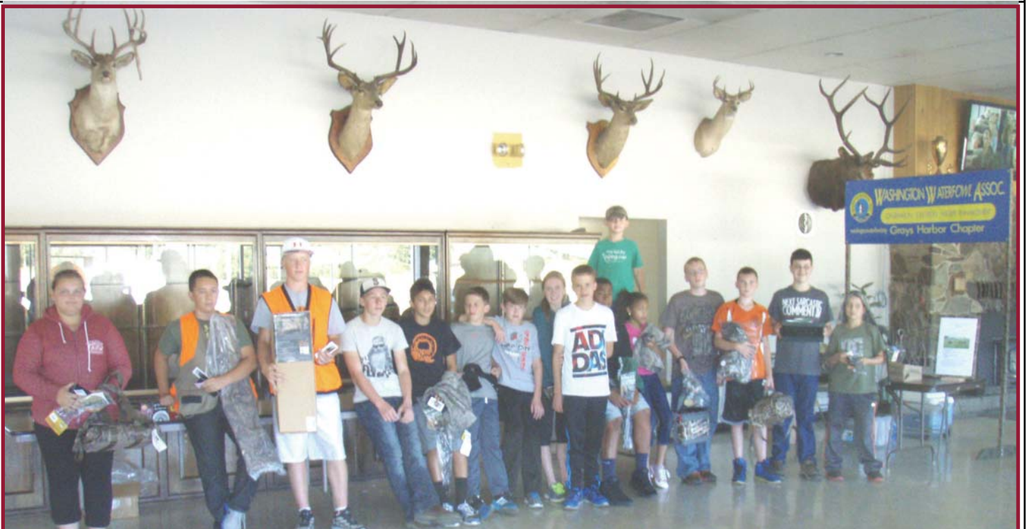
The record number of Youth Participants that enjoyed the event, freebies, and raffle prizes!